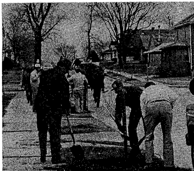
Volunteers plant trees on Lorena Avenue

WANTED TO BORROW - old photographs of Benbow City & Wood River for a Wood River History display at the Library. Photos needed by April 30. For more information, call Susan at 254-4832