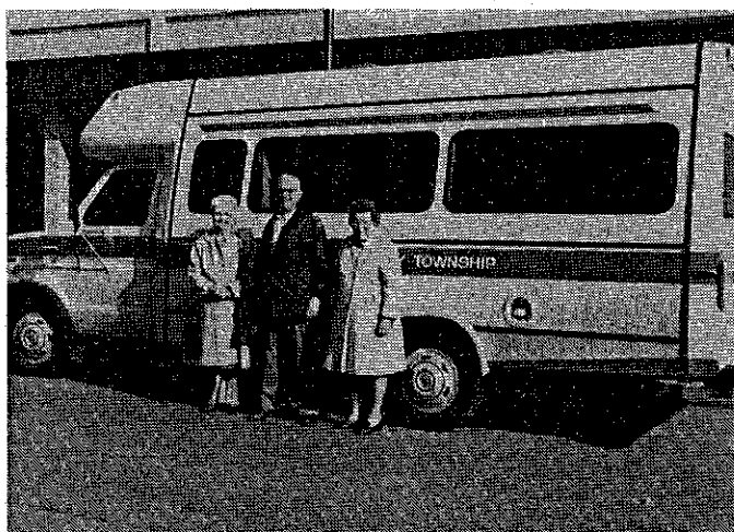
Our new bus will look like this one, used by smiling seniors in Granite City