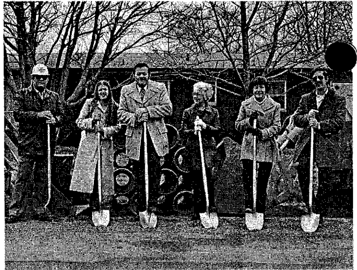
Groundbreaking ceremony in Glendale Gardens. Soon, 99% of the City will have sewer service.